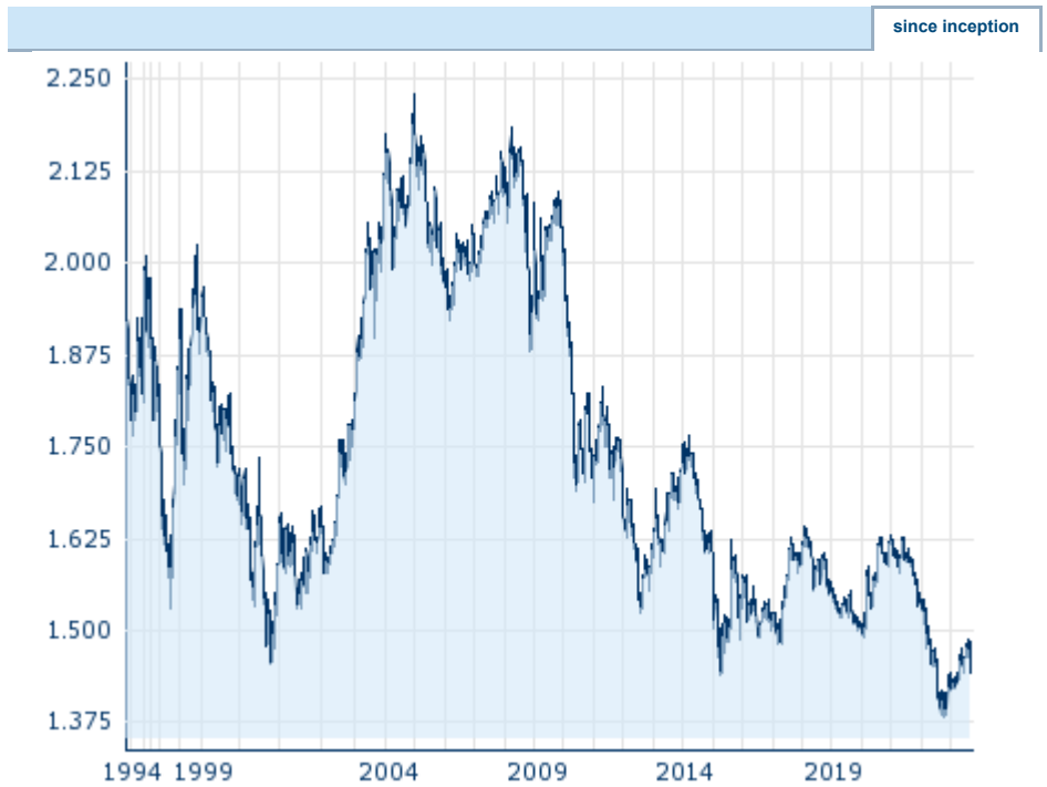
Performance since inception. Performances under 12 month have only little informative value because of the short maturity. Information about previous performance does not guarantee future performance.

Futures and Options Related Futures - Related Options -