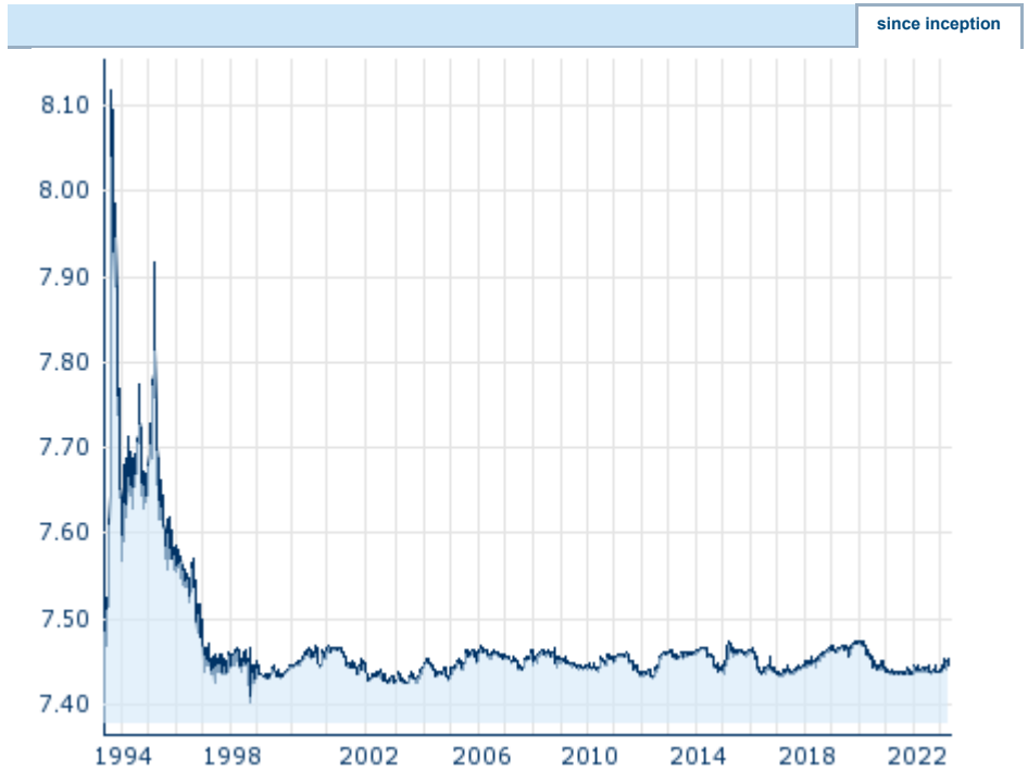
Performance since inception. Performances under 12 month have only little informative value because of the short maturity. Information about previous performance does not guarantee future performance.

Futures and Options Related Futures - Related Options -