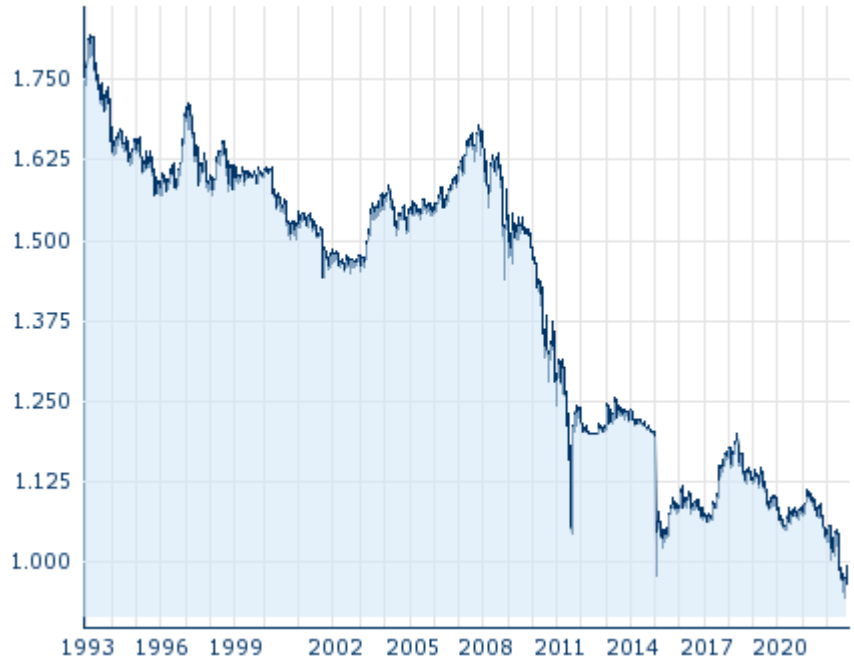
Performance since inception. Performances under 12 month have only little informative value because of the short maturity. Information about previous performance does not guarantee future performance.