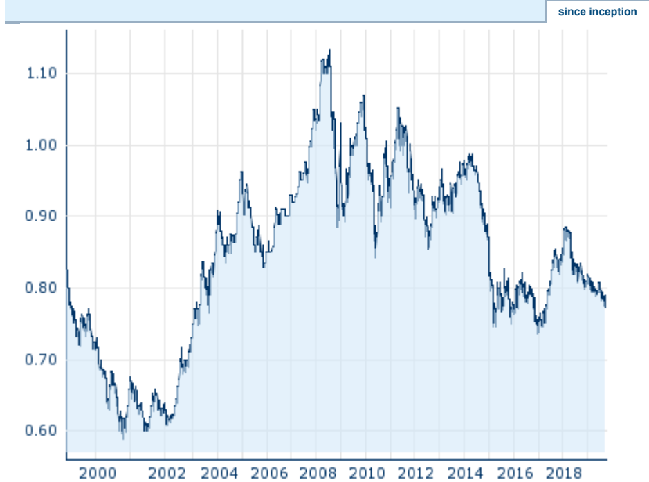
Performance since inception. Performances under 12 month have only little informative value because of the short maturity. Information about previous performance does not guarantee future performance. Source: Erste Group Bank AG