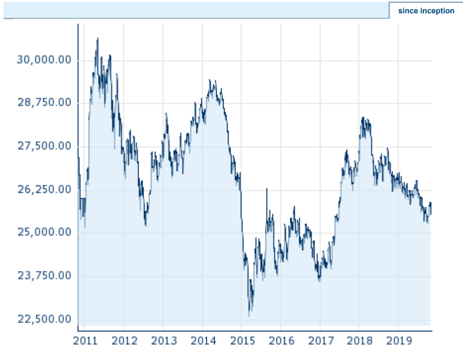
Performance since inception. Performances under 12 month have only little informative value because of the short maturity. Information about previous performance does not guarantee future performance. Source: Erste Group Bank AG