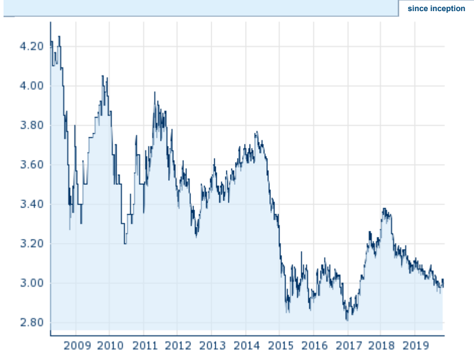
Performance since inception. Performances under 12 month have only little informative value because of the short maturity. Information about previous performance does not guarantee future performance. Source: Erste Group Bank AG

Futures and Options Related Futures - Related Options -